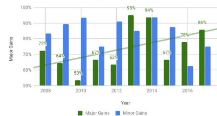
Parent Feedback Reporting Major & Minor Gains 2008 to 2017

If you have questions or wish to discuss a specific child, please visit our website: www.lunchgroups.com